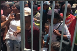
The feeding scheme in the township of Heideveld is vital for many families.