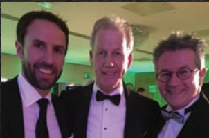
England Manager Gareth Southgate taking on board some tactical nous!