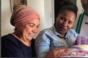
Abandoned baby. Just one month old. Now in emergency care with Goal50.