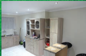
Safe House, Heideveld awaiting the full intake of needy children.