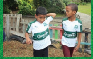
The army of Plymouth Argyle fans - Pilgrims - continues to grow.