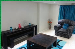
Safe House, Heideveld. A place where young children will flourish.