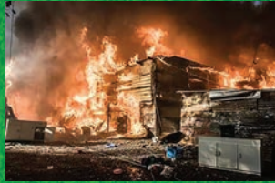
During the recent drought, fire was another frightening danger.