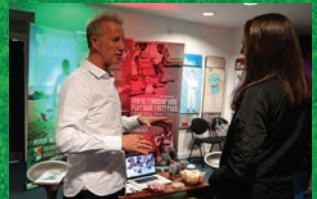
New Wine, Guernsey. An opportunity to present the Goal50 story.