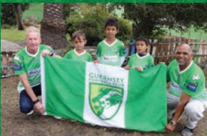
More Guernsey FC fans in the townships of the Cape Flats.