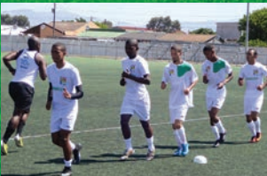
Heideveld teams UNITE to heighten football standards on and off the pitch.