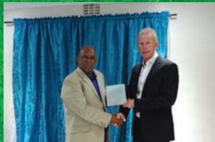
Goal50 receives the Heideveld Civic Trust Award for help in the community.