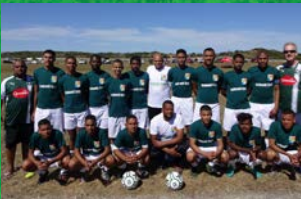
Goal50s pioneering semi-pro soccer club has the strapline - HEIDEVELD UNITE