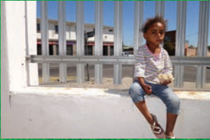
The food programme continues to support township families.